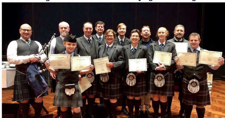
Our winning members at a recent Solo Piping & Drumming Event.

As always we look forward to performing at the next SMCF events and the other Scottish Lodge functions we provide our pipers and drummers to.