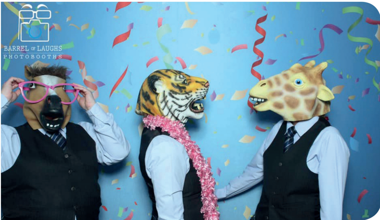
Pictured above: 3 members at our recent Annual fundraising “Celtic Shindig” in July this year. Do you know who they are??

It's not all serious competition stuff, as you can see from the photo above. Our members work very hard, continually practicing and fundraise to do what they love. This photo is a great example of the comradery of our group who like to work hard a play even harder!