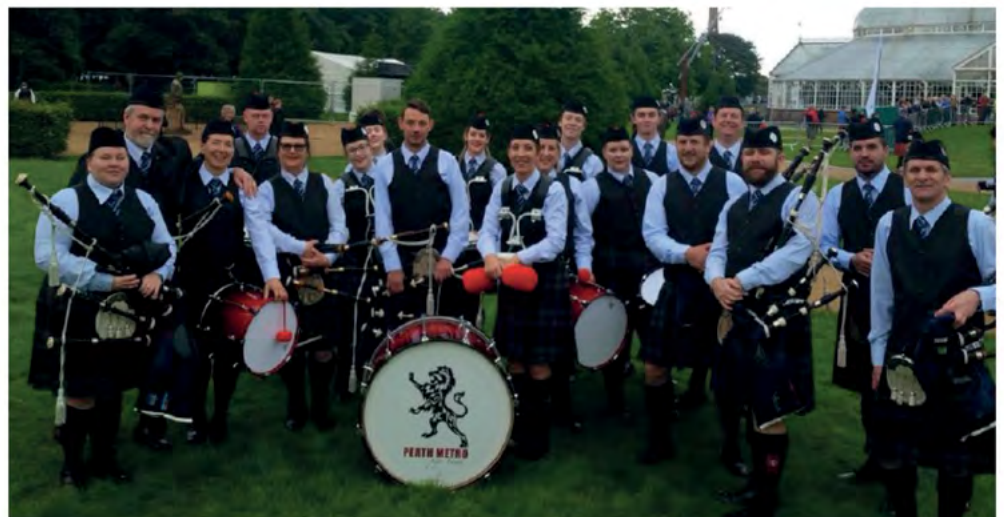
Our Grade Four Band after their Qualifying performance

We look forward to performing at the next SMCF events and other Scottish Lodge functions we provide our pipers and drummers to.